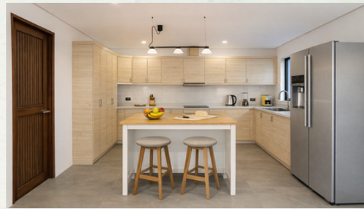
*Space designs imagined with A.I.